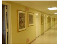
Turning Point's Arrowood Facility

Clients of Turning Point are assigned a Primary Case Manager who monitors their care, and provides individual counseling and support throughout their treatment stay. The "Passport to Recovery" transitions clients through different phases in their treatment. Main topics covered in daily education groups include: